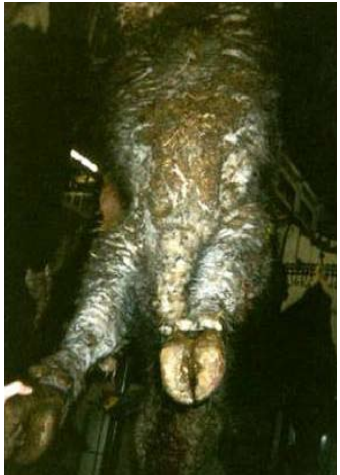
Figure 1: Excessive dag adhering to the coat will not only make hide opening difficult, but also lead to carcass contamination

As a result of the association between dirty hides and high carcass microbiological counts, some countries have introduced a 'clean livestock' policy, and use a subjective rating system for assessing the cleanliness of cattle presented for slaughter. Although mobs of cattle that are scored 'cleaner' will tend to give lower carcass microbial counts, there does not seem to be a consistent relationship between cleanliness score for an individual animal and its own carcass microbial load. However, the scores within each sale lot tend to be similar, and this makes the system a useful tool.