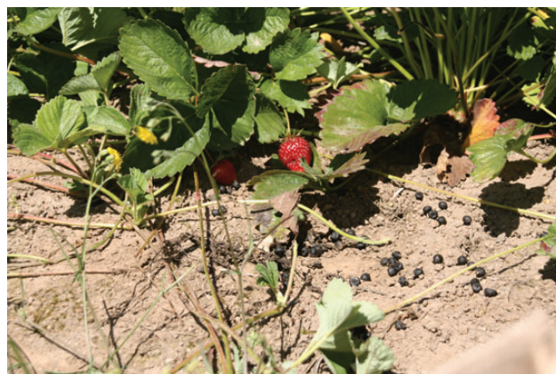
Figure 3. Deer feces among strawberry plants at farm A.

Deer were first identified as a source of E. coli O157 infections following a 1995 outbreak that occurred <100 km from farm A [13]. Handling or consuming deer or elk meat has been repeatedly identified as a source of E. coli O157:H7 infections [13–15].