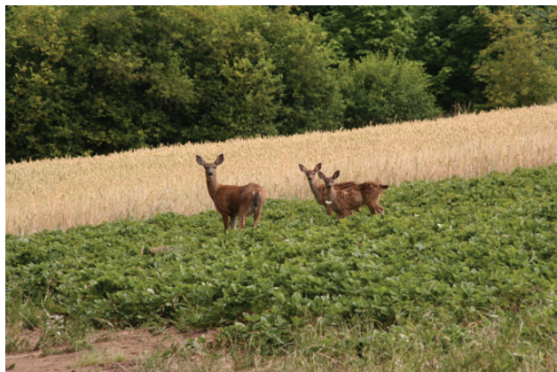
Figure 2. Black-tailed deer in postharvest field, farm A.

On 6–7 August, we provided a summary of our findings to the owner of farm A, other public health agencies, and interested business groups. On 8 August, in cooperation with the owner of farm A, we announced our findings and advised the public to discard any remaining fresh or frozen strawberries that might have come from farm A or any of the identified retail outlets.