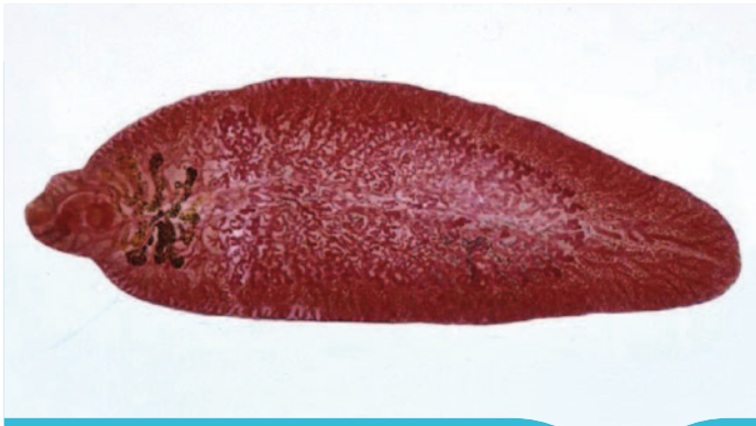
Adult Fasciola hepatica (hydrochloric carmine staining)

Fasciola hepatica , or common liver fluke, is the agent of fascioliasis, a disease mainly affecting ruminants and more rarely humans. It is a non-segmented cosmopolitan flatworm belonging to the group of Plathelminthes , class of Trematoda and family of Fasciolidae . The adult worm measures from 15 to 30 mm long and 10 mm wide and lives in the bile ducts of wild and domestic mammals, as well as those of humans.