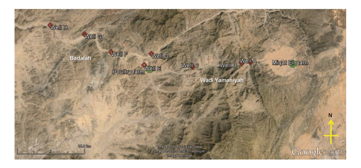
Figure 1. Sampling site in Taif, Saudi Arabia. Groundwater samples were collected from wells A through H. Groundwater direction flows from A to H. Tomatoes and green peppers irrigated with groundwater from wells B and F were sampled. Green circles denote potential sources of anthropogenic contamination. Miaqt E1 Qarn is a gathering venue for pilgrims.