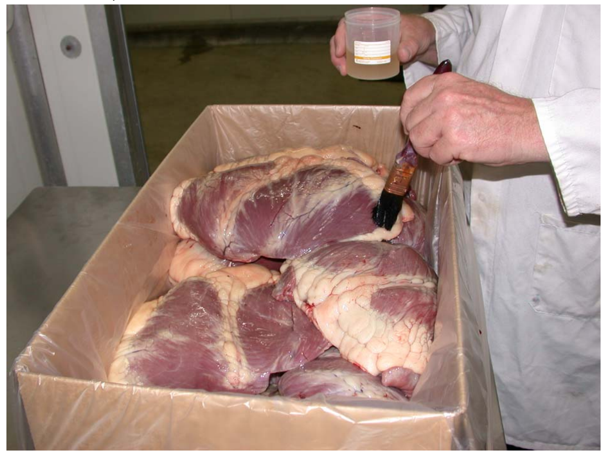
Figure 1: Brushing the inoculum onto the surface of beef hearts

The counts before and after freezing were each converted to log_{10} values and the E. coli growth at each site calculated by subtracting the log count before freezing from the log count after freezing. The log growth was then plotted against the RI using Microsoft Excel and a linear relationship calculated.