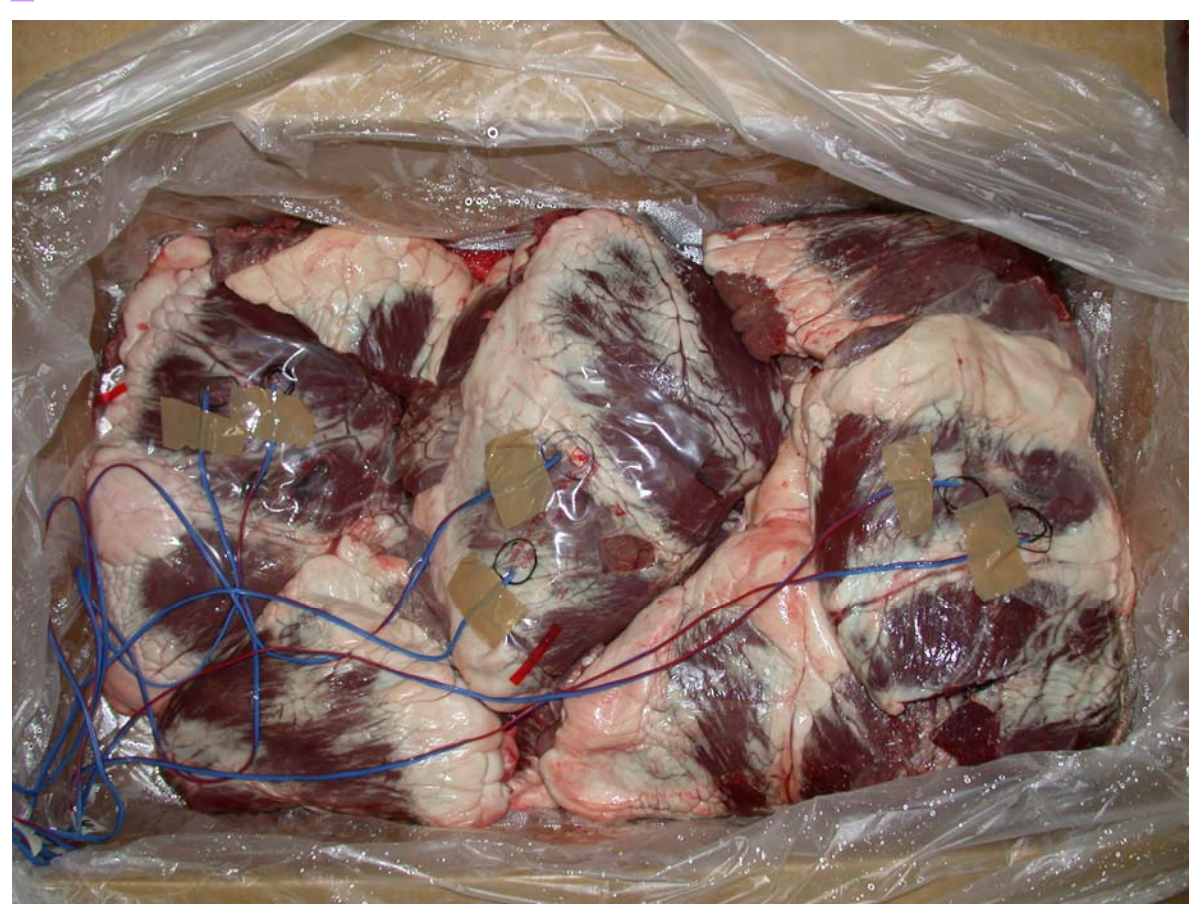
Figure 2: Thermocouples taped to the surface of beef hearts