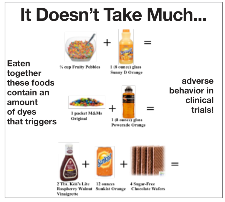
Figure 3. Small amounts of dyes in foods trigger adverse reactions in sensitive children.

Hawaiian Punch (14.1 mg) and has a treat such as 4 pieces of Twizzlers (15.4 mg) or a Red, White and Blue Popsicle (21.6 mg) would consume more than the amount of dyes that were used in the early studies—amounts that triggered behavioral reactions in some children. (Figure 3)