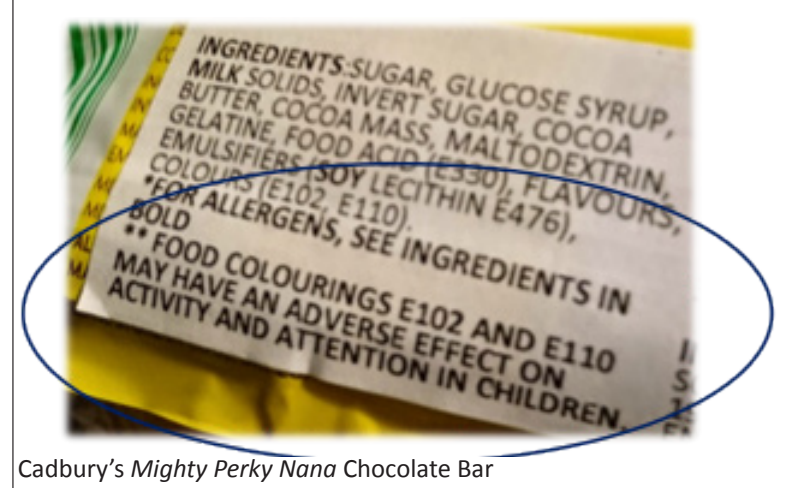
Figure 5. Warning label required on most dyed foods in the European Union.

Following the British actions, the European Parliament passed a law that went into effect in 2010 requiring a warning label on products containing any of the six artificial colorings tested in the Southampton study. The warning states: "[name colorings] may have an adverse effect on activity and attention in children." (Figure 5) The Parliament also prohibited the use of food dyes in foods for infants and young children.<sup>61</sup> That law helped rid the European food supply (which never had as many dyed foods as the American food supply) of most dyed foods, so the warning appears on only a few products.