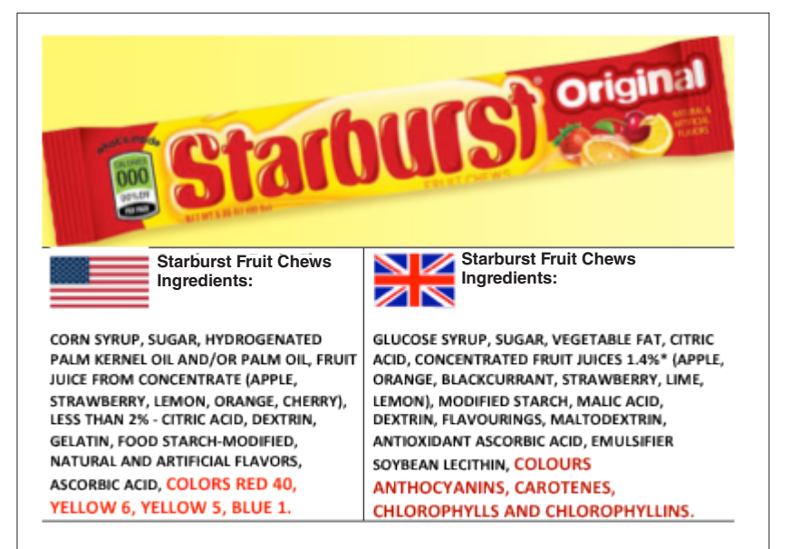
Figure 8. Many companies reformulate popular foods in Europe, but not America, to avoid having to use the warning label.

In Europe, where governing bodies have targeted artificial colorings, many retailers, manufacturers, caterers, and restaurants have agreed not to use the six dyes tested in the Southampton studies and reformulated their products to avoid having to use the required warning label. (Figure 8)