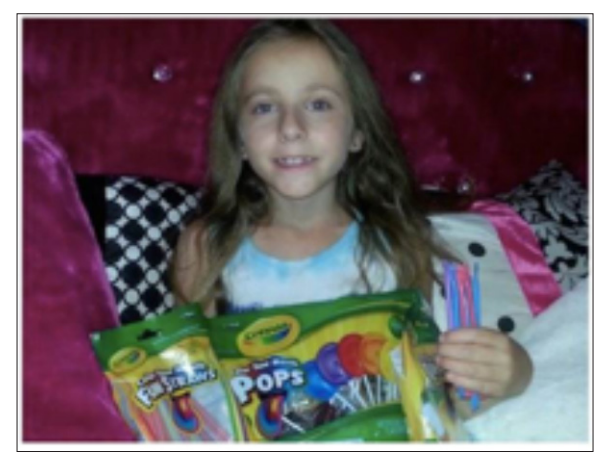
Crayola: Stop Telling Kids to "Color Their Mouth" with Fake Dyed Candies.

Due to consumer pressure, some food manufacturers, restaurants, and grocery chains are removing dyes from at least some of their products. (Food Dyes: Honorable Mentions)