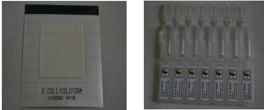
Fig. 1. (a) RIDA® count plate; (b) Natrium Chloride solutions

In total, 72 samples of FCS include four samples: dining tables, food trays, cooking pots, and kitchen faucets in six identified food services in the states of Perak and Selangor. In this study, estimation of the total counts bacterial was done by using a contact plate test of RIDA® COUNT test plate for the detection of E.coli and total coliforms on FCS as shown in Fig. 1. (a) and (b) below.