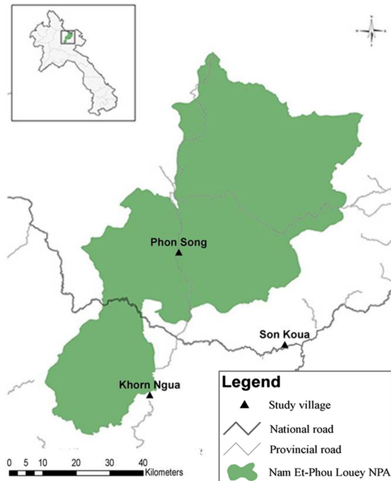
Fig. 1 Location of the three study sites in Laos. The map also shows the Nam-Et Phou Louey National Protected Area and roads

cultivation cycle. The agricultural season can be divided into four sub-periods: slash and burn, planting, weeding, and harvesting. No commercially produced fertilizers and pesticides are applied. Wild animals and plants are considered important sources of calories, protein, and essential vitamins. The main trapping and catching techniques for rodents are snares, single-capture traps, and pitfall traps.