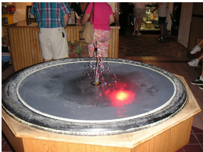
Figure 3 Decorative fountain situated in the lobby of Restaurant A.

where people shopped and worked, and to map grids through which case-patients were significantly more likely than controls to have traveled. Apart from exposure to cooling towers (using map grids as a proxy), analysis of potential exposures where more than half the case-patients had visited did not initially show any significant differences between case-patients and controls. This hypothesis was strengthened by the timing of the outbreak at the start of summer with many towers bearing heavier cooling loads and running in excess of 100% capacity due to a hotter than usual summer in South Dakota. Thirdly, as outlined in the background, cooling towers are common sources of community outbreaks of LD.