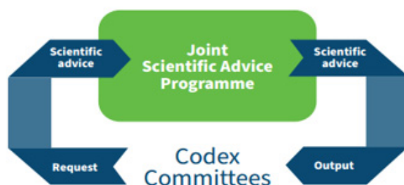
Figure 1. Information flow between JEMRA and the Codex Committee on Food Hygiene (CCFH).

The primary purpose of the establishment of JEMRA was to provide scientific advice to Codex. Based on their needs for information, Codex committees, primarily the CCFH, prepare specific request for information and communicate their needs for scientific advice to the JEMRA secretariat. As with other FAO/WHO Joint scientific Advice Programmes, the JEMRA secretariat works in close collaboration with Codex Committees' group Chairs to ensure that the scientific advice of JEMRA is truly tailored to the Committee's needs (Figure 1). Once complete, JEMRA reports back the Committees that have requested the information.