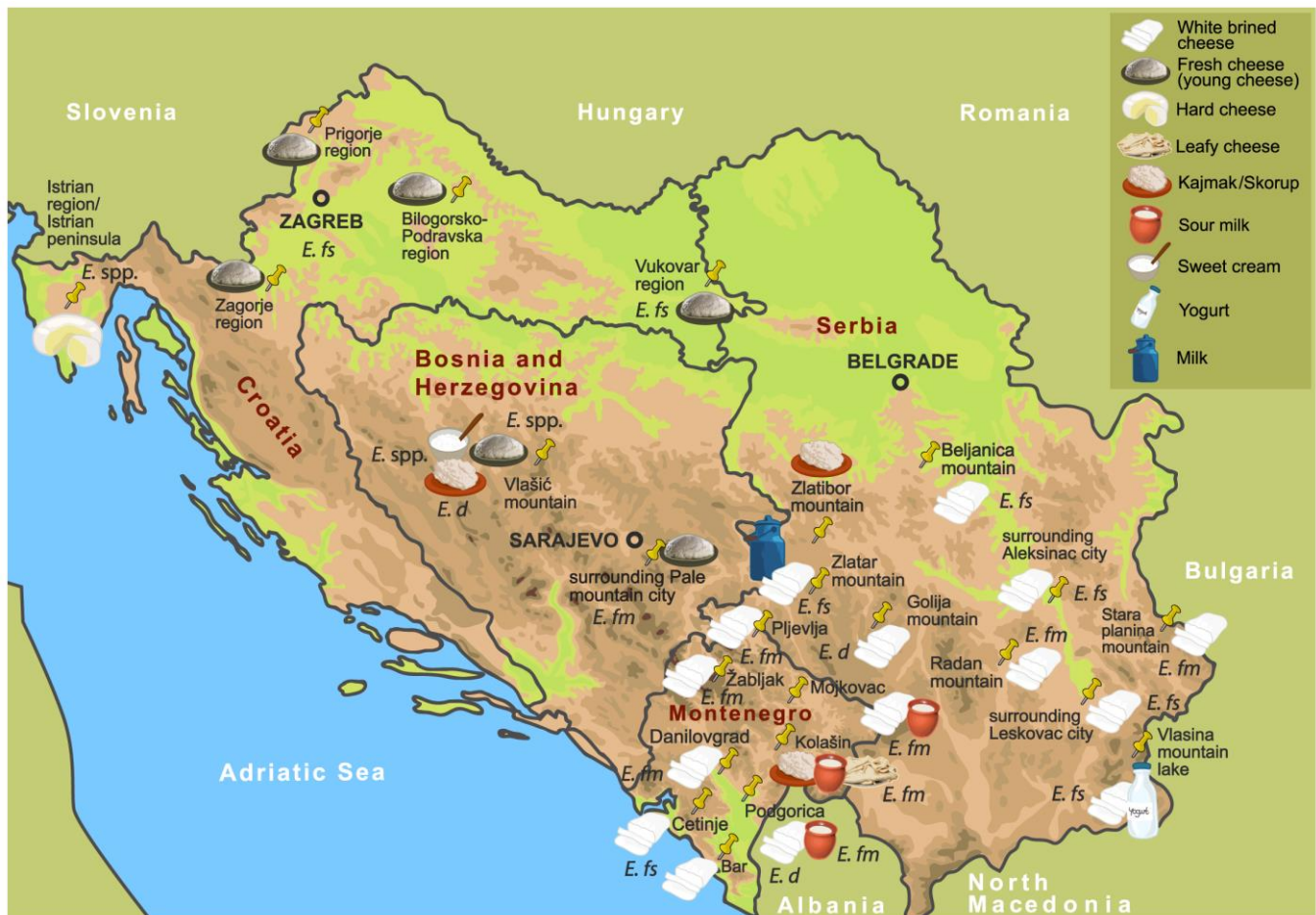
Figure 1. Artisanal raw milk dairy products manufactured in the region of Western Balkan Countries as a source of Enterococcus spp. Note: Most prevalent Enterococcus spp. in certain geographical localities: E. spp. , Enterococcus species; E. fm , Enterococcus faecium ; E. fs , Enterococcus faecalis ; E. d , Enterococcus durans [11,54].

cheeses, sweet creams, and sweet kajmaks in Bosnia and Herzegovina; and leafy, white and semi-hard cheeses and skorups in Montenegro (Figure 1) [11,33,47,48,52,53,62,63]. Most of them were identified as E. durans (44%), E. faecalis (35.9%), and E. faecium (17.9%), while less than 2% were E. italicus strains [33]. Similar data were reported by authors who determined the enterococcal population in artisanal dairy products manufactured in other regions [64,65].