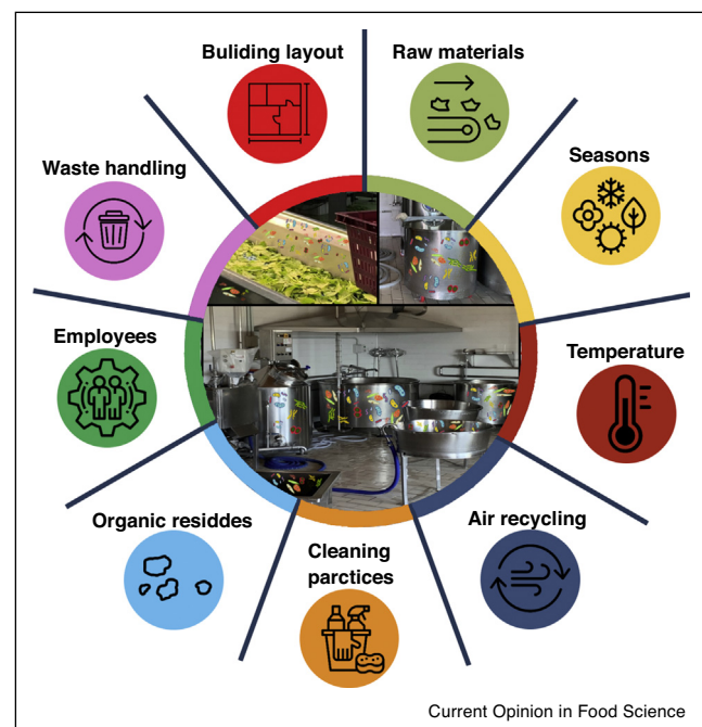
Factors influencing environmental microbiome in food industry.